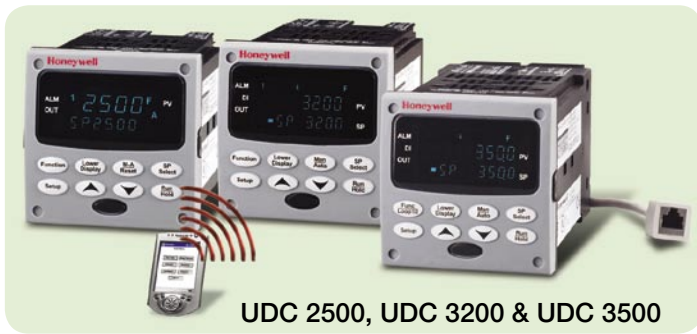
UDC 2500, UDC 3200 & UDC 3500